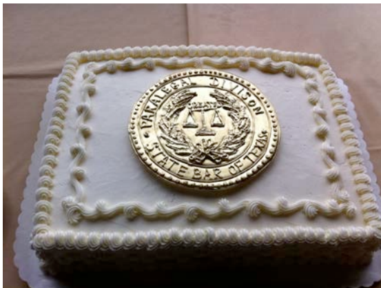
The special cake for the occasion

The Texas Senate was the first in the nation to observe Paralegal Day, and many states have since followed suit. The official date is October 23, which marks the anniversary of the founding of the Paralegal Division of the State Bar of Texas.